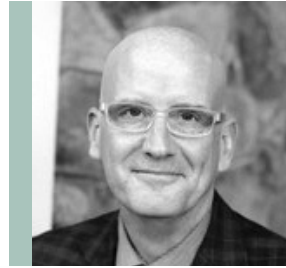
DANIEL T. WILLINGHAM

Paul Givan MLA was appointed Minister for the Department of Education in Northern Ireland in February 2024. Since taking office, he has prioritised transforming teaching and learning through an ambitious programme of reform, focusing on curriculum development, modernising assessment, reviewing qualifications, driving school improvement and tackling educational disadvantage. His leadership is centred on raising standards, widening opportunity, and ensuring every child and young person regardless of their background enjoys a truly world-class education.