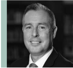
PAUL GIVAN MLA

Paul Givan MLA was appointed Minister for the Department of Education in Northern Ireland in February 2024. Since taking office, he has prioritised transforming teaching and learning through an ambitious programme of reform, focusing on curriculum development, modernising assessment, reviewing qualifications, driving school improvement and tackling educational disadvantage. His leadership is centred on raising standards, widening opportunity, and ensuring every child and young person regardless of their background enjoys a truly world-class education.